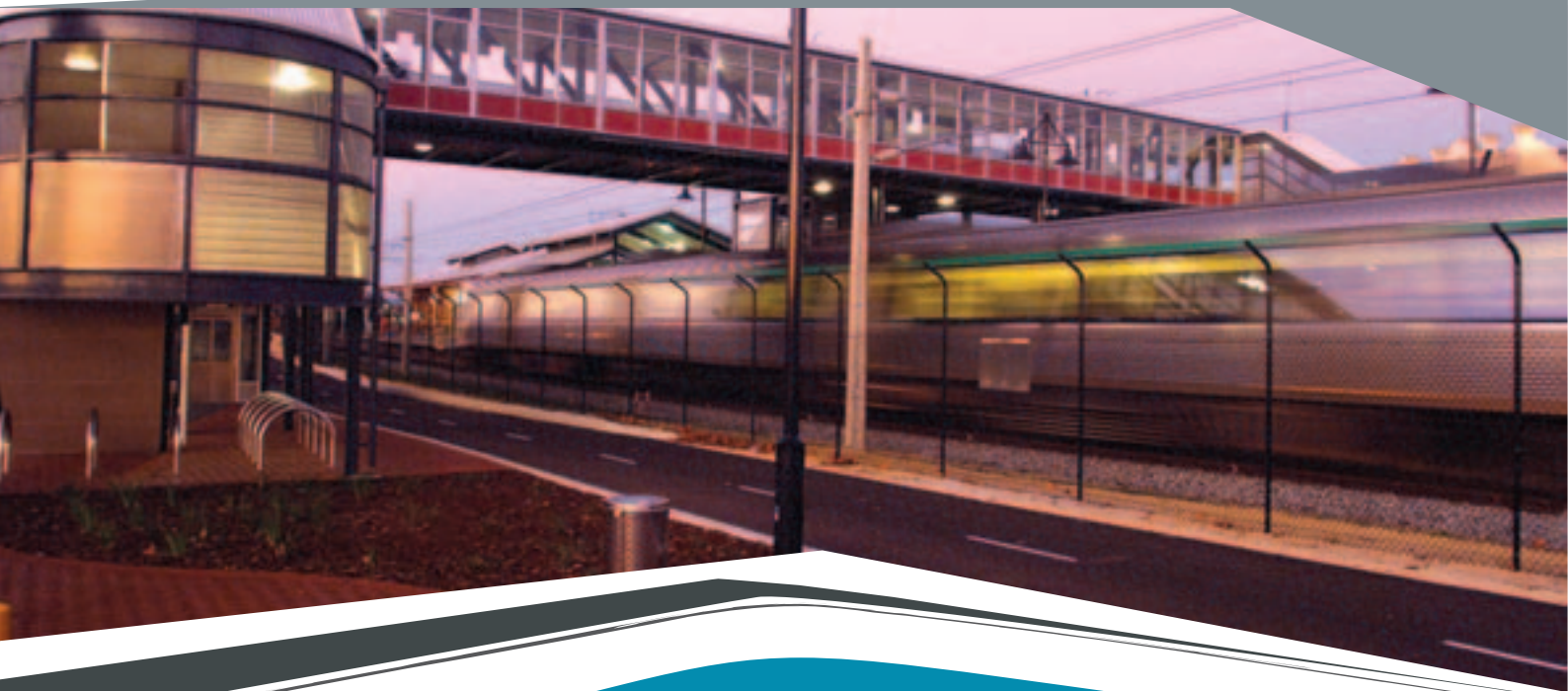
A new station at Bassendean was opened in July 2004