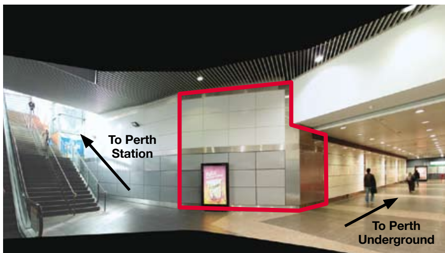
Proposed entrance to the new pedestrian underpass from Perth Underground.

Stage two is the section connecting Perth Station to Perth Underground. This complex section will go under the heritage-listed Perth Station building and link up with Perth Underground (under Wellington Street). This stage runs from mid-2012 to mid-2013.