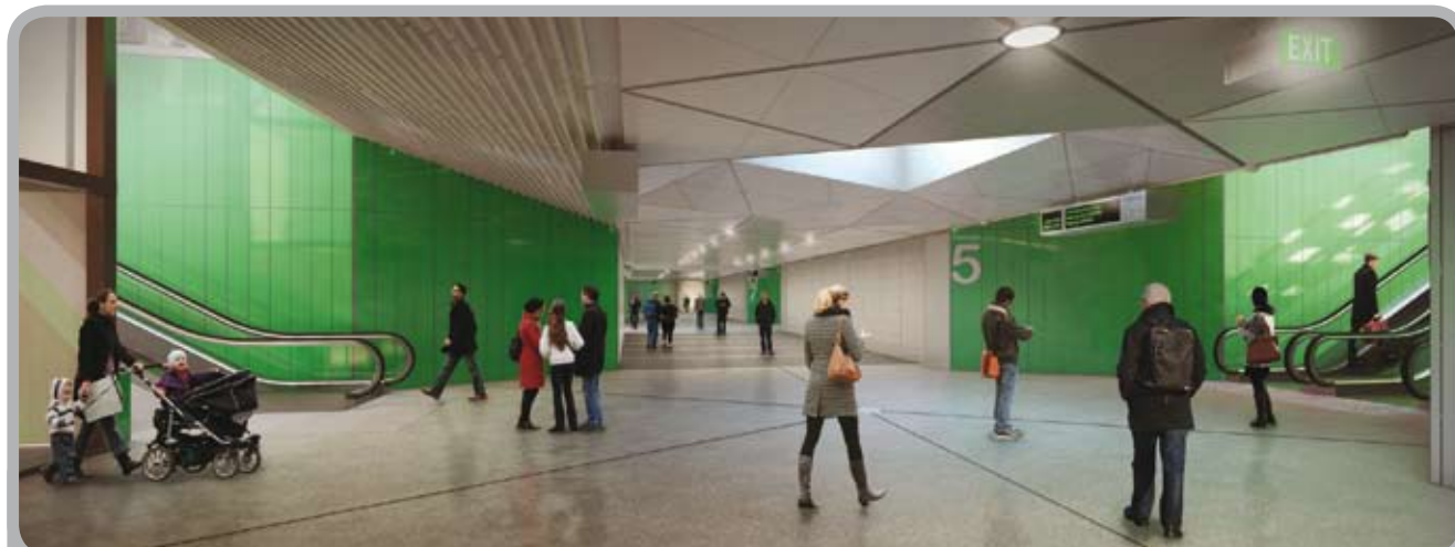
TOP: Perth Station layout in 2014 with the new pedestrian underpass. BOTTOM: An artist impression of the new underpass.