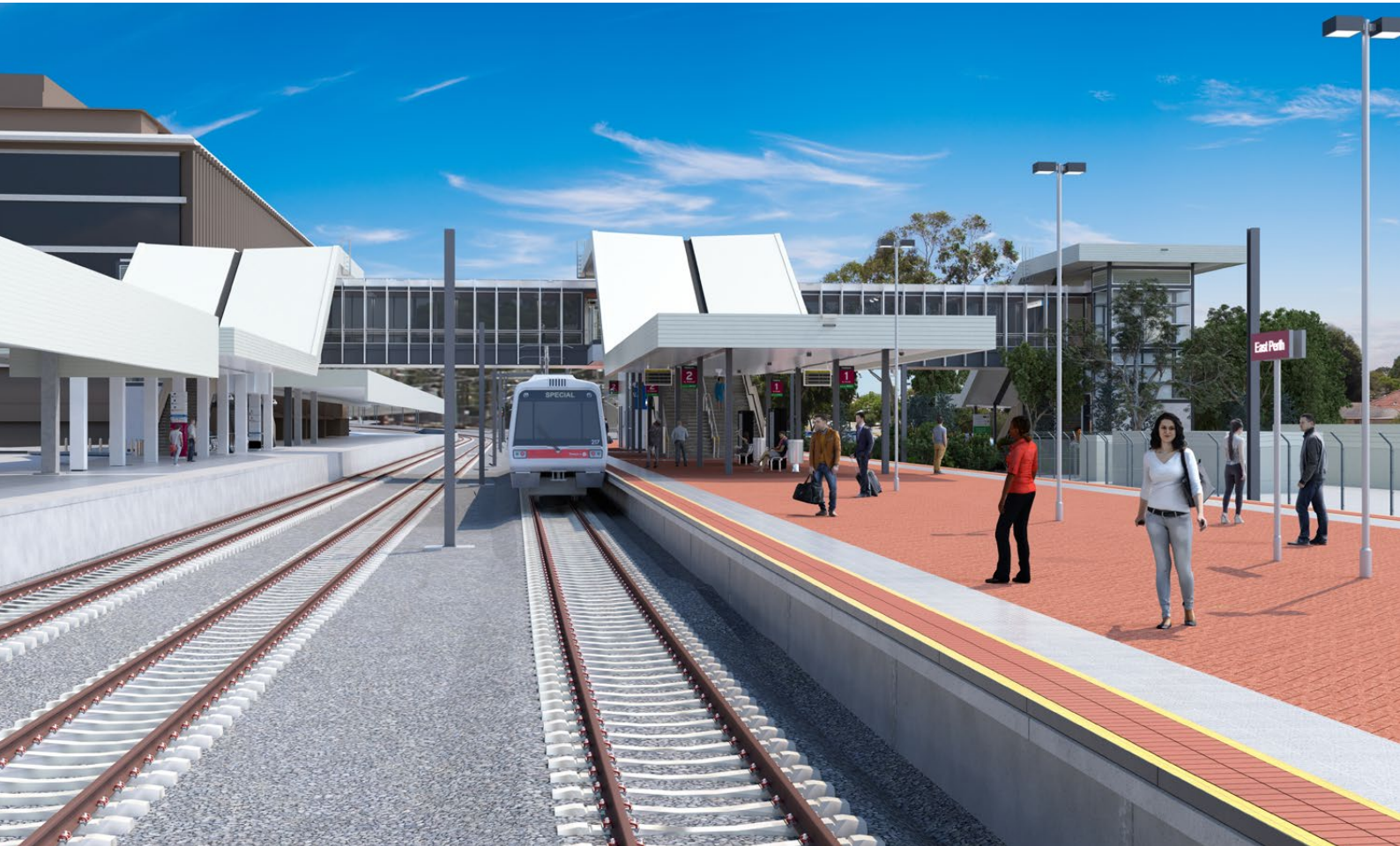
Artist's impression of the upgraded East Perth Station

Work on the East Perth Station Upgrade project is now well underway with a new temporary platform installed at the southern end of the station, the northern section of the island platform demolished and bulk earthworks complete. Work to install the pre-cast platform walls will begin in February.