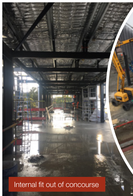
Internal fit out of concourse