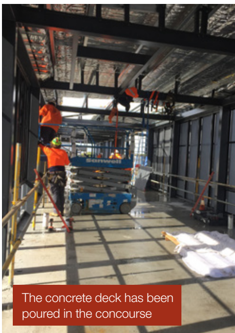
The concrete deck has been poured in the concourse