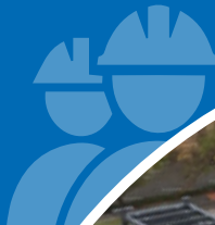
Installation of concourse roofing

Once complete, the $25 million upgrade will make the station more modern, accessible and better able to host the larger crowds expected once Perth Stadium opens early next year.