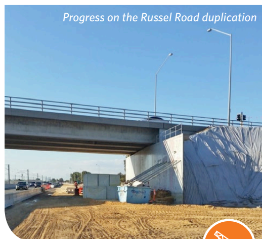
Progress on the Russell Road duplication