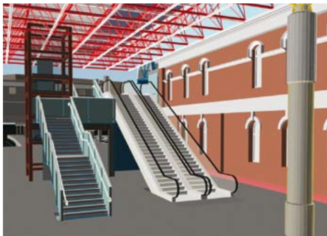
Artist impression of the new stairs.