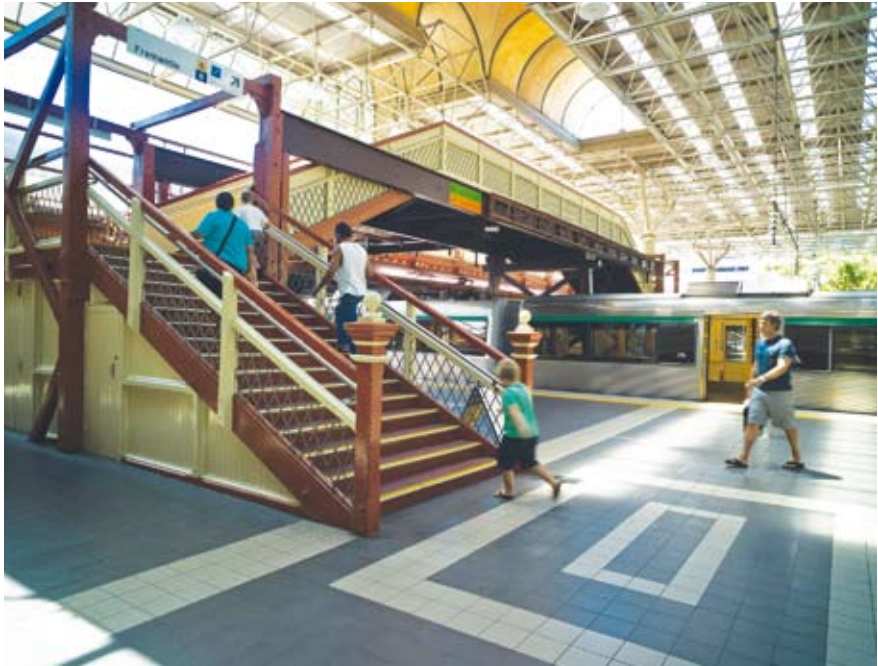
Heritage-listed timber footbridge.

All work will be behind solid fencing and will follow an approved dust management plan.